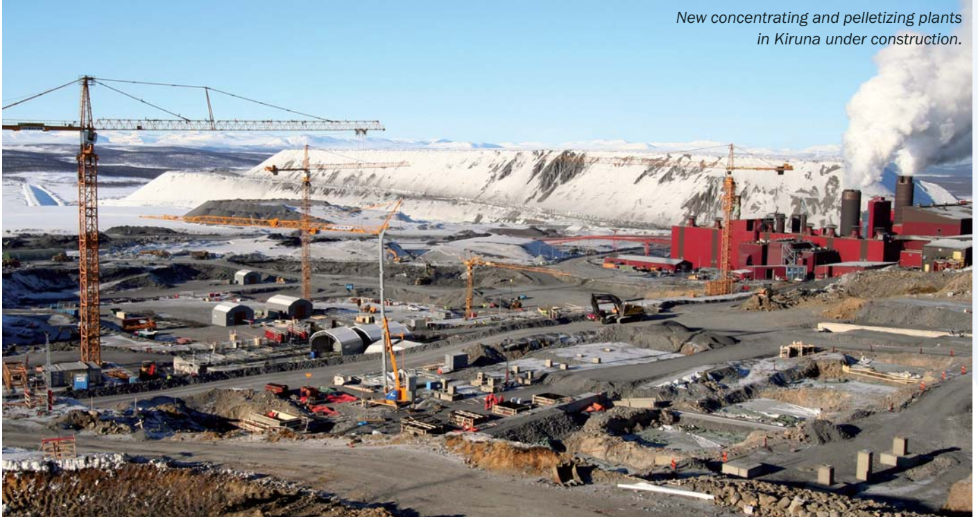
New concentrating and pelletizing plants in Kiruna under construction.

LKAB in Sweden and its suppliers have placed an order with Kumera Drives for mechanical drives to be installed at the new concentrating and pelletizing plants in Kiruna. Start-up of the new plant will be in spring 2008.