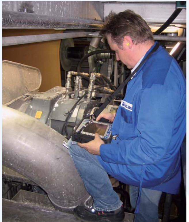
Kumera Drives provided start-up supervision of the integrated roll drives in September 2006. The Project Manager measures vibration with the spectrum analysis device.

Because the delivery was the very first of its kind, the scope of supply included also two drives for the test run. The test was carried out in order to minimize the functional problems of the integrated roll drives. “We test ran the drives in our own test laboratory in April 2006. The test measured the general functionality of the construction and lubrication”, says the Project Manager responsible for the engineering of the new gear range series. “In addition, we supervised the start-up of the PM3 in Dörpen in