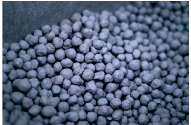
Iron ore pellets produced by LKAB

letizing and concentrating plants in Malmberget and Kiruna, increased capacity in the Kiruna mine and investment in a new harbour in Narvik, as well as investment in logistics. Investments will raise LKAB's delivery capacity for iron ore products from a current 23 million tonnes to 25 Mt by 2007 and to 30 Mt by 2008.